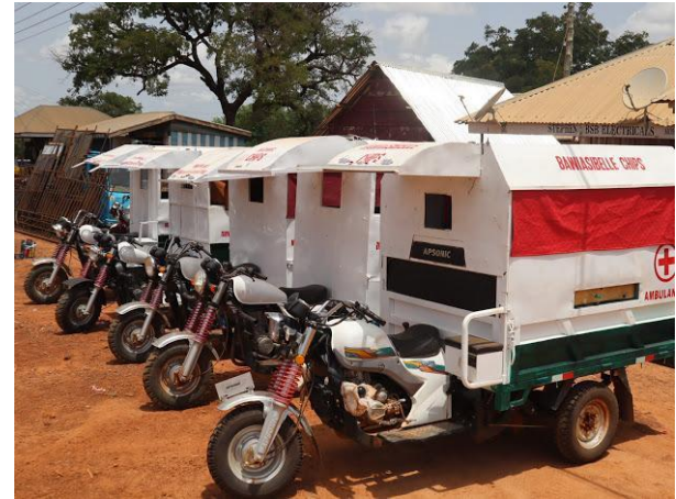
MIT D-Lab + Course 2 - Emily Young startup Moving Health develops low cost, sustainable emergency vehicles for Africa