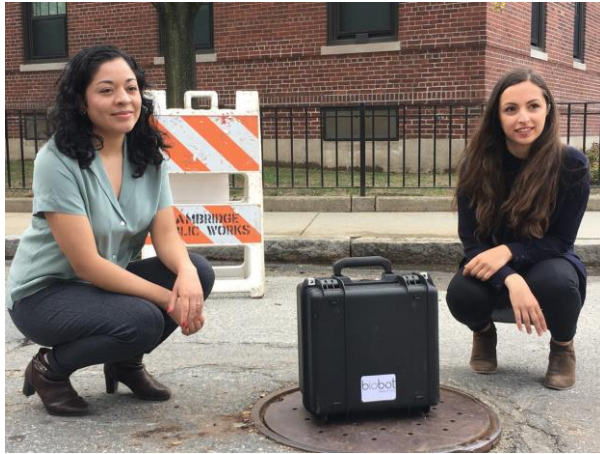
Biobot.io (Course 7 + Course 11) venture backed startup transforms wastewater infrastructure into public health observatories