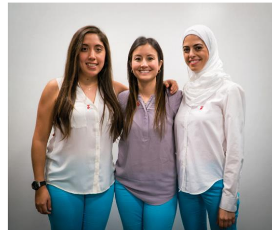
Bloomertech (Course 6 + IDM) designs smart clothing to address gender gap in health analytics