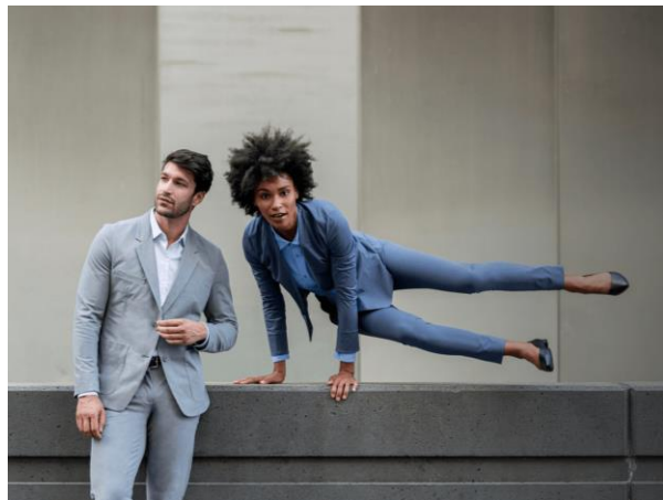
Ministry of Supply - engineered, high performance clothing started by Course 10, 2 and Sloan alums